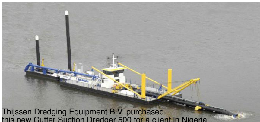
Thijssen Dredging Equipment B.V. purchased this new Cutter Suction Dredger 500 for a client in Nigeria

13 Elitor Street Tel: 00234 803 714 0220 Behind Woji Town Hall Tel: 00234 805 747 7474 Woji Town, Port Harcourt Tel: 00234 808 798 6590 Rivers State, Nigeria