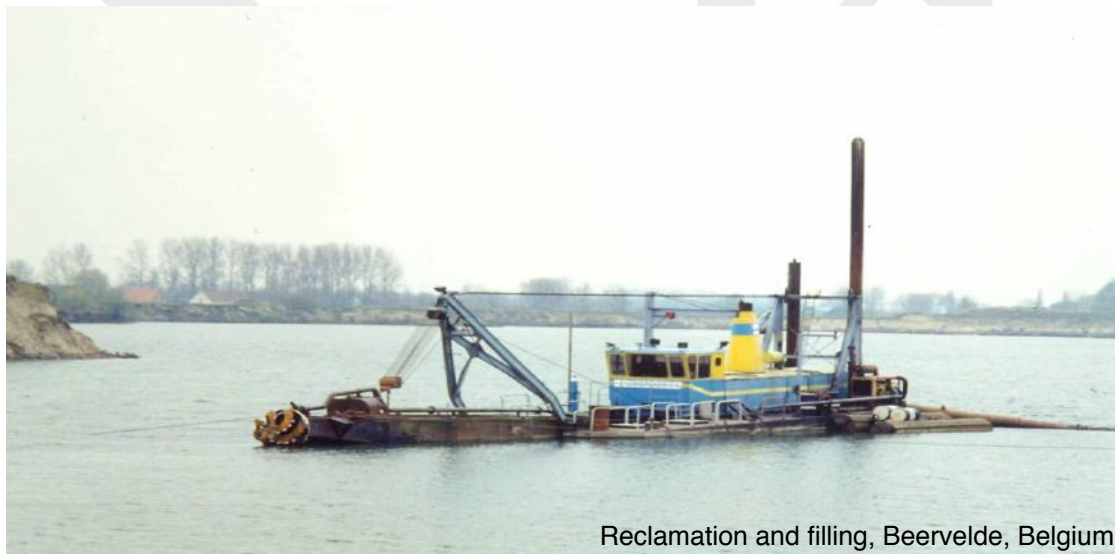
Reclamation and filling, Beervelde, Belgium