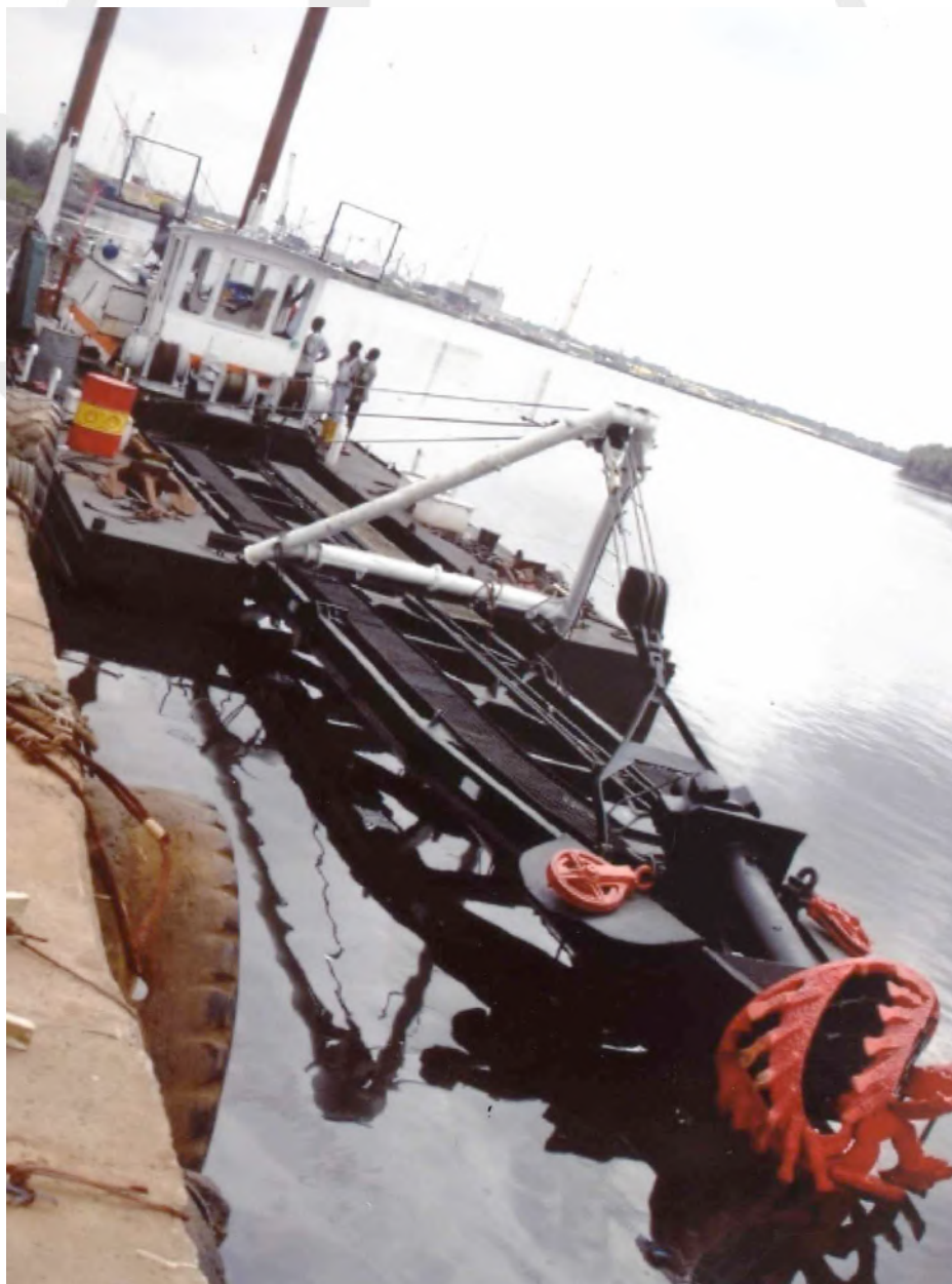
Cutter Suction Dredger of Strides Export Nigeria Ltd. Nigeria