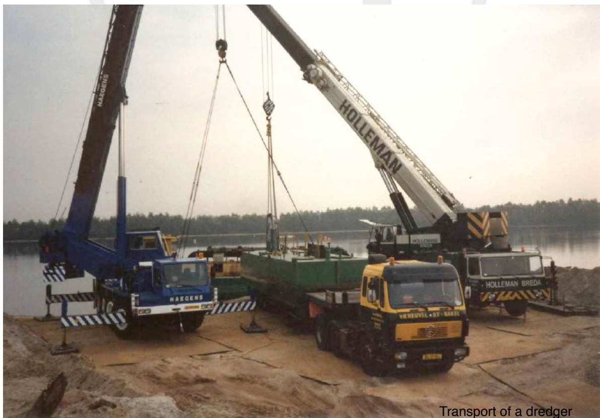
Transport of a dredger