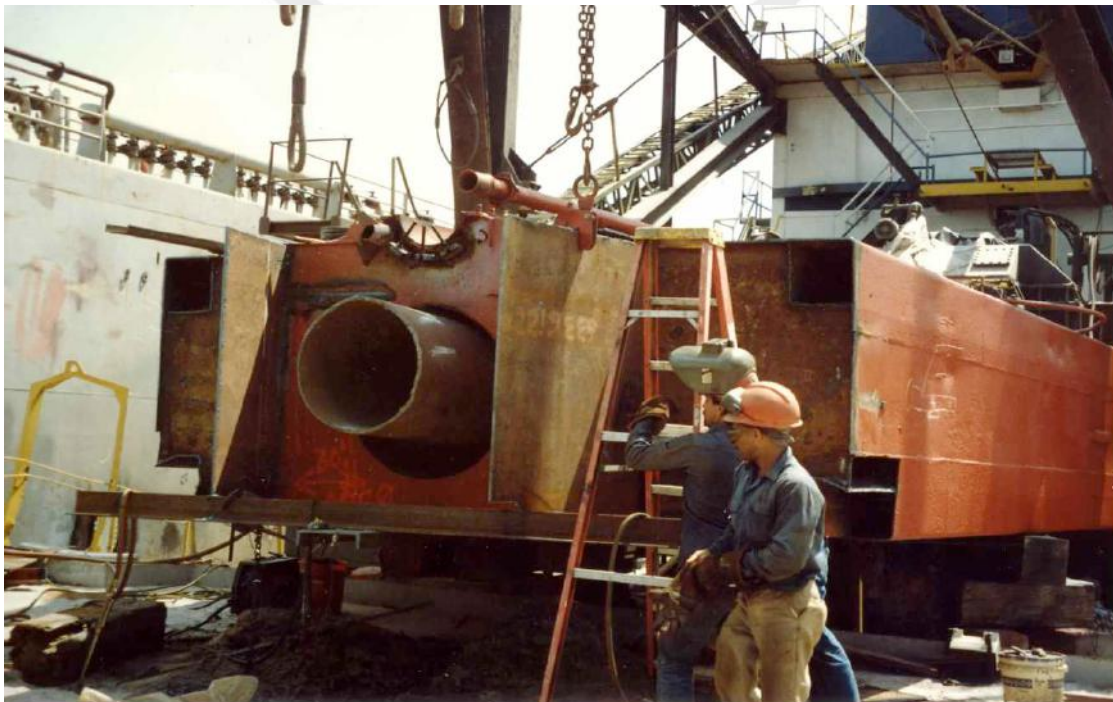
Extension of a 24" Cutter ladder